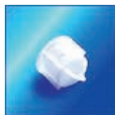
Built in Filter